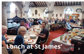
Lunch at St James'