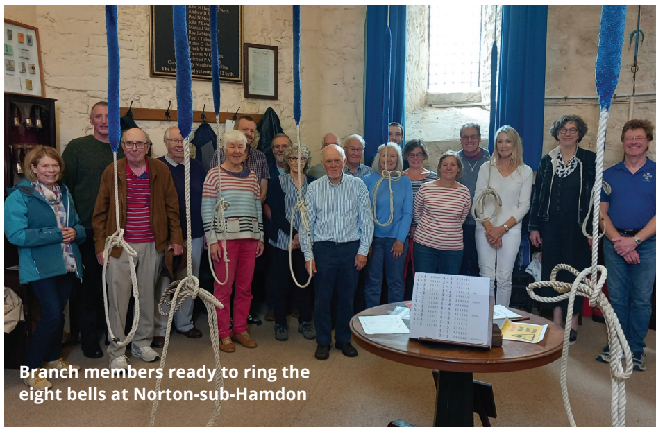
Branch members ready to ring the eight bells at Norton-sub-Hamdon