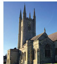
Left: The tower at St Michael's Church, Mere

And in a fitting celebration of this exciting news, local bell ringers rang for the project's launch party. Along with other members of the community, they will be very much involved in this important project over the next eighteen months.