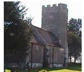
Right: St Margaret's Church, Margaret Marsh, Dorset in its rural setting