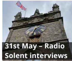
31st May - Radio Solent interviews