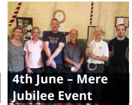
4th June - Mere Jubilee Event

The church bells of St Peter's attracted plenty of visitors to our fundraising and open day. There was plenty of interest in the displays of how bells work, while tea and cakes provided by branch members were popular as people waited to try chiming a bell. Thanks to all those who helped promote ringing we raised £215.00 and signed up some potential new ringers.