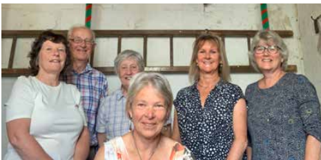
Above: At Hindon, Wiltshire, rounds and call changes were rung to coincide with St Paul's

Thanks to everyone who contributed their skills and time, bringing pleasure to so many local communities.