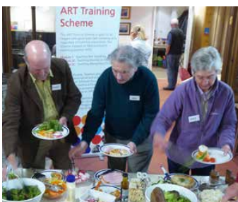
Above: Lunch provided an opportunity to swap stories and discuss learning from the morning session