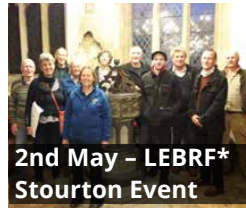
2nd May - LEBRF* Stourton Event