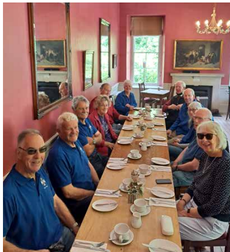
Above: Members of towers in the Benefice of Upper Stour, spanning the Dorset-Wiltshire border, met for breakfast before ringing on 3 rd June. They performed 30 minutes of call changes on the six-bell towers at Stourton, Zeals and Bourton through the morning.