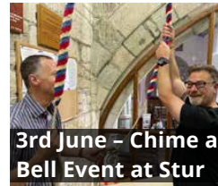
3rd June - Chime a Bell Event at Sturminster Newton