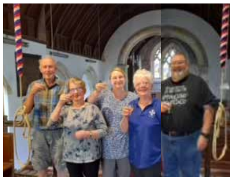
Below: Some of the band went on to ring the five bells at Kington Magna in the afternoon