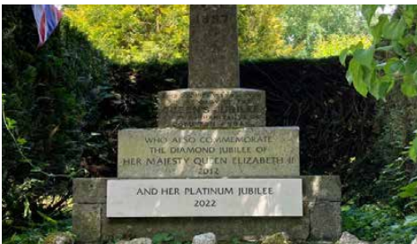
Above: The bells rang out at Compton Abbas to mark the unveiling of the latest plaque on the Jubilee Obelisk during the village party on the first day of the extended bank holiday