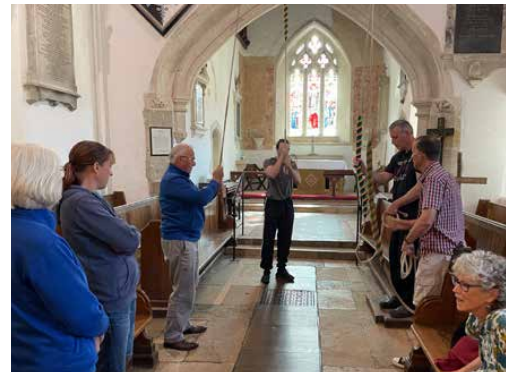
Above: First ring of the day at the historic and beautiful St Mary's, Breamore. Below: Tackling the 8 glorious bells at St Laurence's, Downton