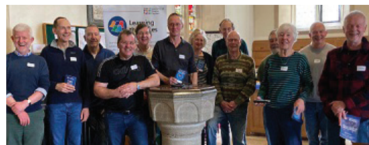
Above: Members at a recent ART training day