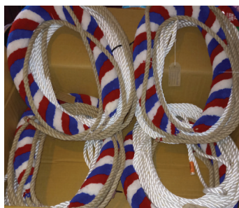
Above: The pristine new ropes waiting to be installed at St Mary's Sturminster Newton

A local charity bingo raised £600 towards the cost of the new ropes, showing just how valued the church bells are in the town.