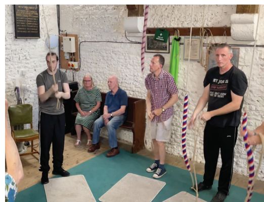
Above: Mere Branch members enjoyed ringing during last year's summer outing

Car sharing will be the ideal way to travel in groups from your local towers and we will aim to ring two towers in the morning and two in the afternoon. Details will be sent round shortly in the form of a flyer for