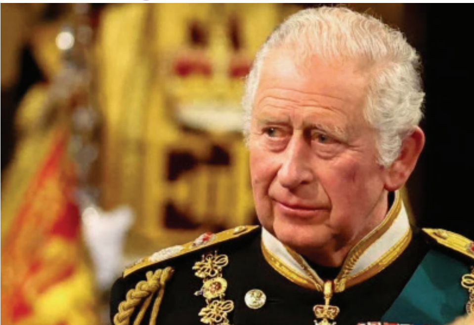
Church bells are to ring out across our patch and throughout the Nation during the Bank Holiday weekend to mark the Coronation of His Royal Highness, King Charles III

With the Coronation taking place at Westminster Abbey on 6th May 2023, ringers up and down the country have been making their arrangements to commemorate this auspicious event. But with so many bands doing the rounds to ring at as many towers as possible, the CCCBR* are encouraging a large degree of flexibility in timing to suit church authorities and ringers.